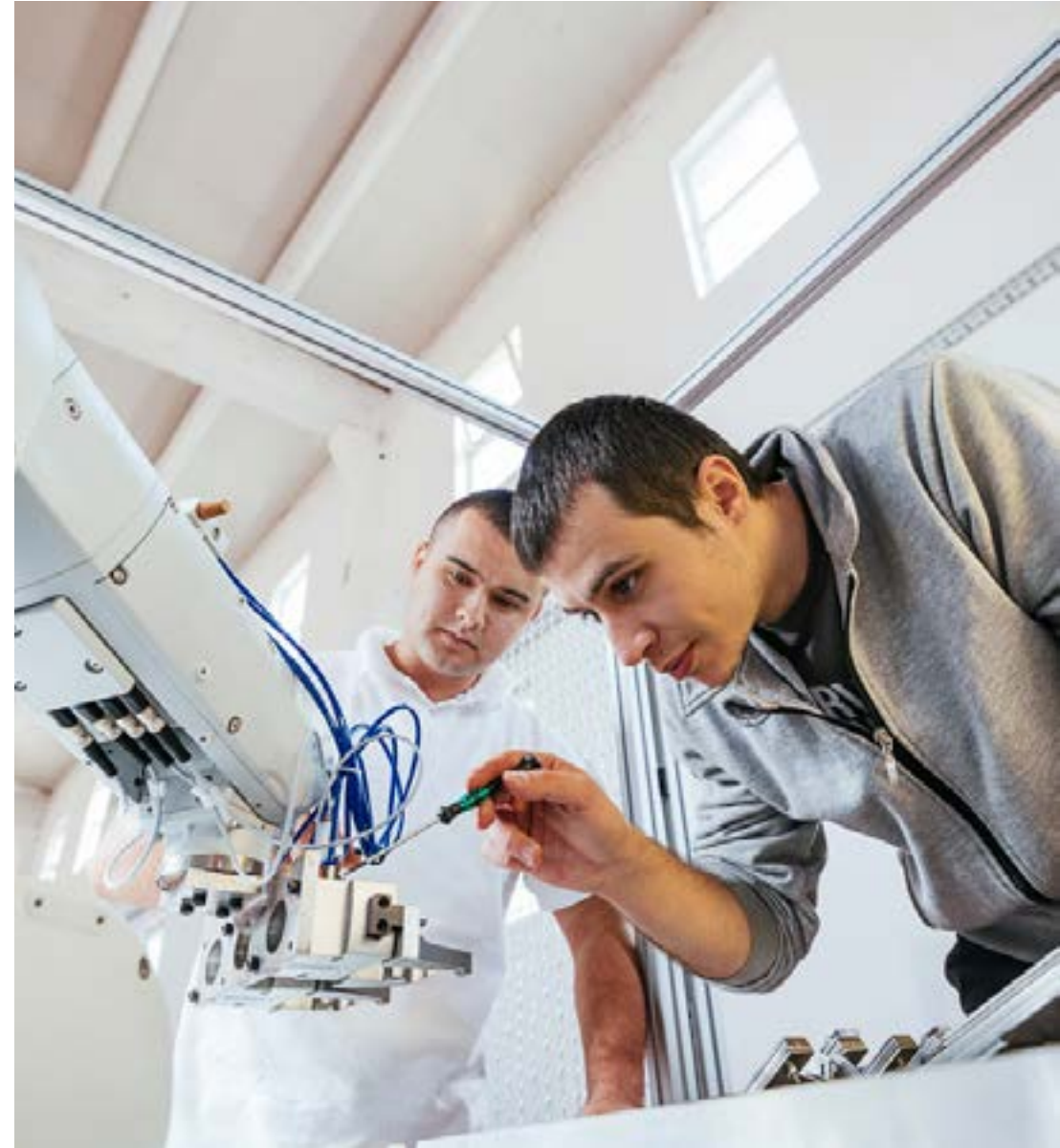
Innovation is an important driver of economic growth

The Levelling Up White Paper also commits to greater levels of public innovation spending outside of the Greater South East. Innovation is an important driver of economic growth and increased productivity, thereby supporting greater levels of innovation has the potential to play a key role in achieving our ambitions for the Staffordshire economy.