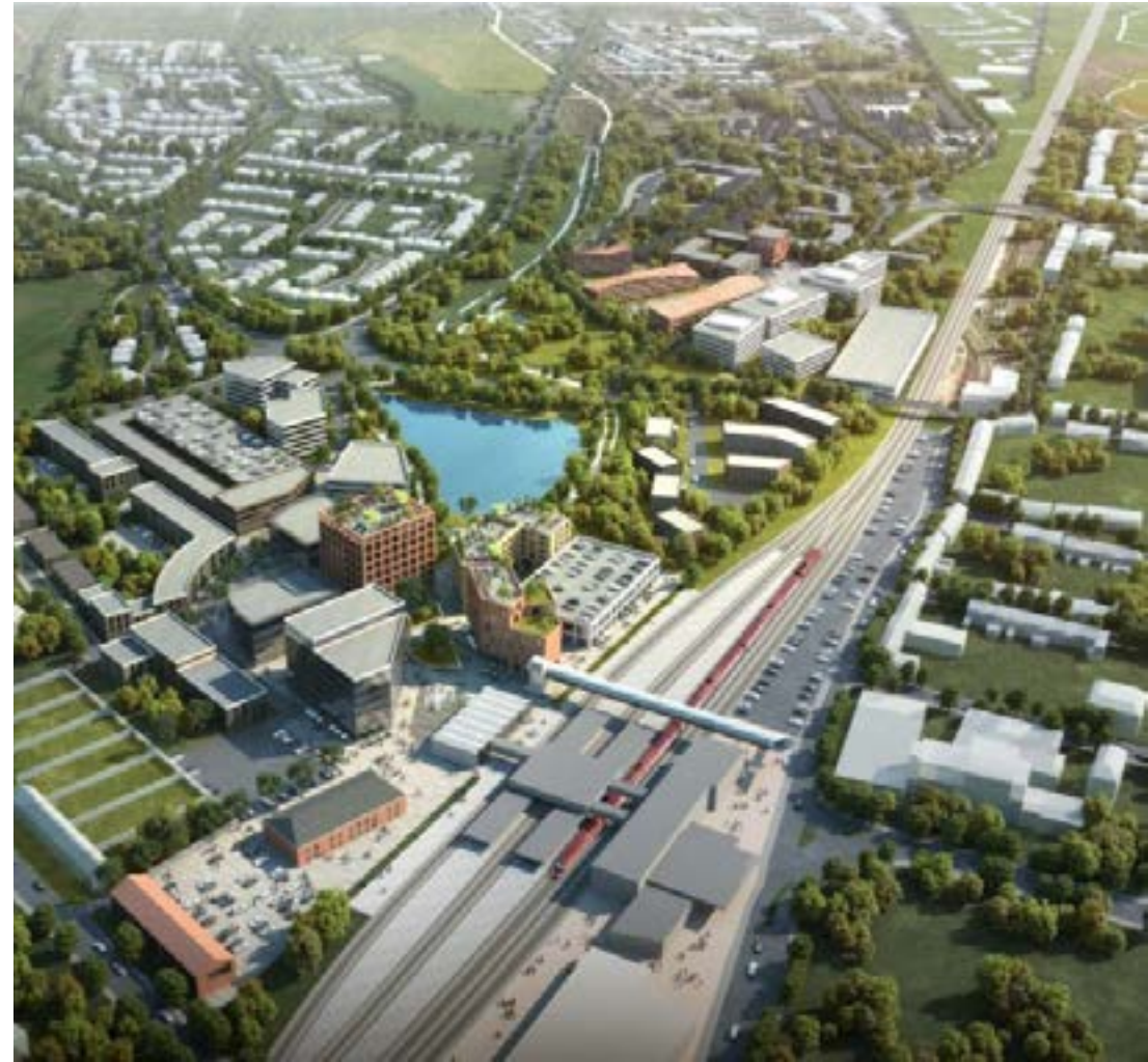
The HS2 Hub planned for Stafford Train Station will create jobs and secure investment, and a whole redevelopment of Stafford is planned to support its potential

Staffordshire will be surrounded by new full-HS2 stations and benefit from classic-compatible HS2 services at Stafford.