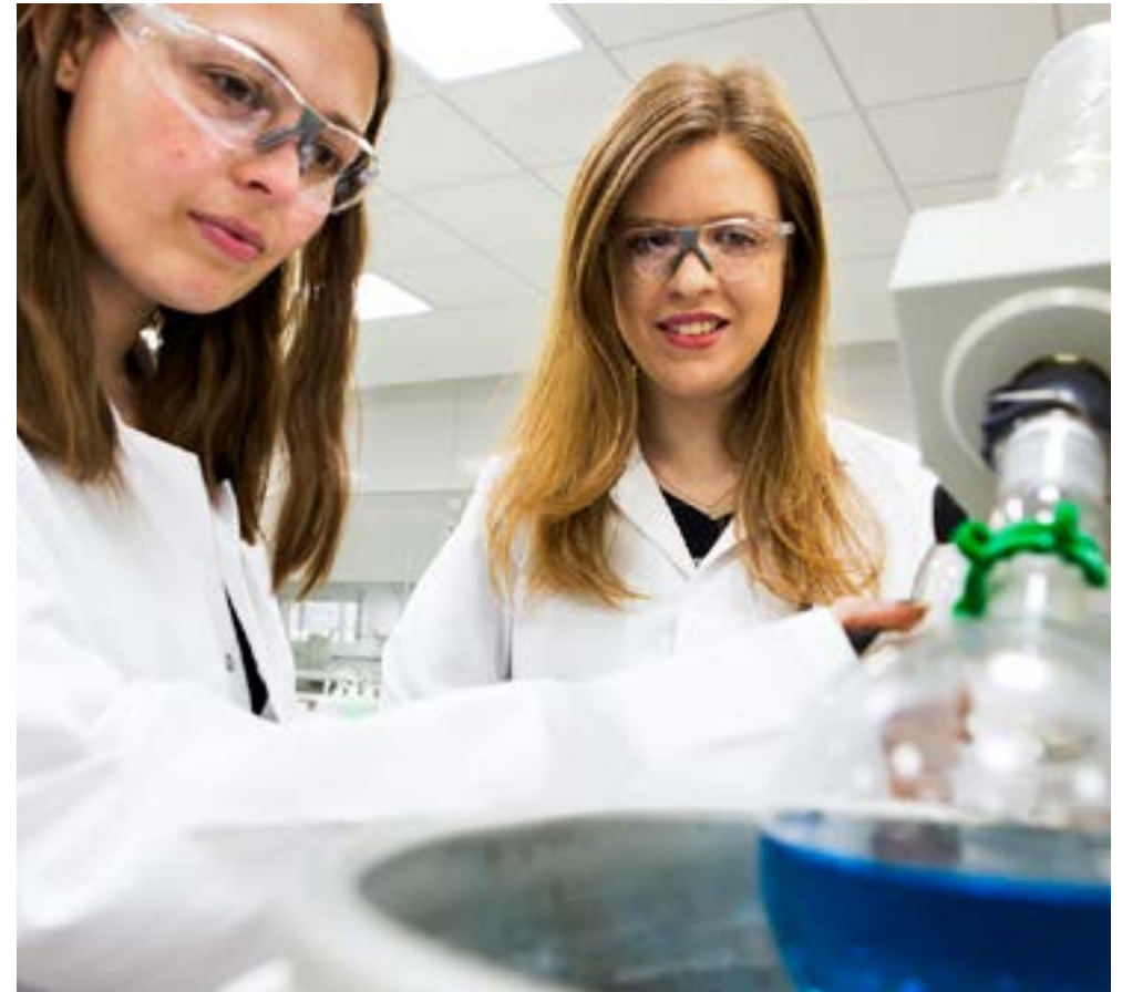
Our economy has recovered well from the pandemic because of a number of reasons, including a successful vaccine rollout

Our immediate priority therefore remains supporting both our businesses and residents through the challenging economic environment to ensure we are well placed to recover strongly.