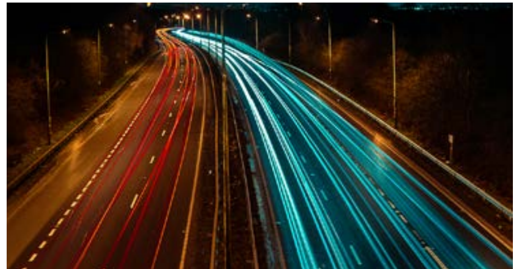
Our strategic corridors have huge potential for economic growth

By 2030, the people of Staffordshire will be able to benefit from more and better paid jobs, with the county being one of the primary locations for sustainable growth and investment in the UK, creating places that we can all be proud of, driven by innovation, new technologies and supporting the move towards carbon neutrality.