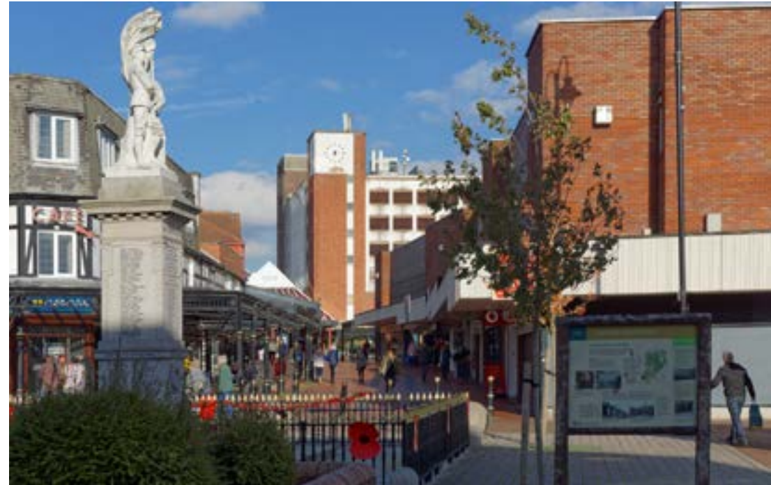
Stafford is just one of the town centres that we will help to revitalise

However, high streets remain vital as places for people to live, meet, access services, enjoy themselves, and for many other reasons. The County Council therefore recognises the importance of reshaping and reimagining our high streets to create places that people value and have pride in.