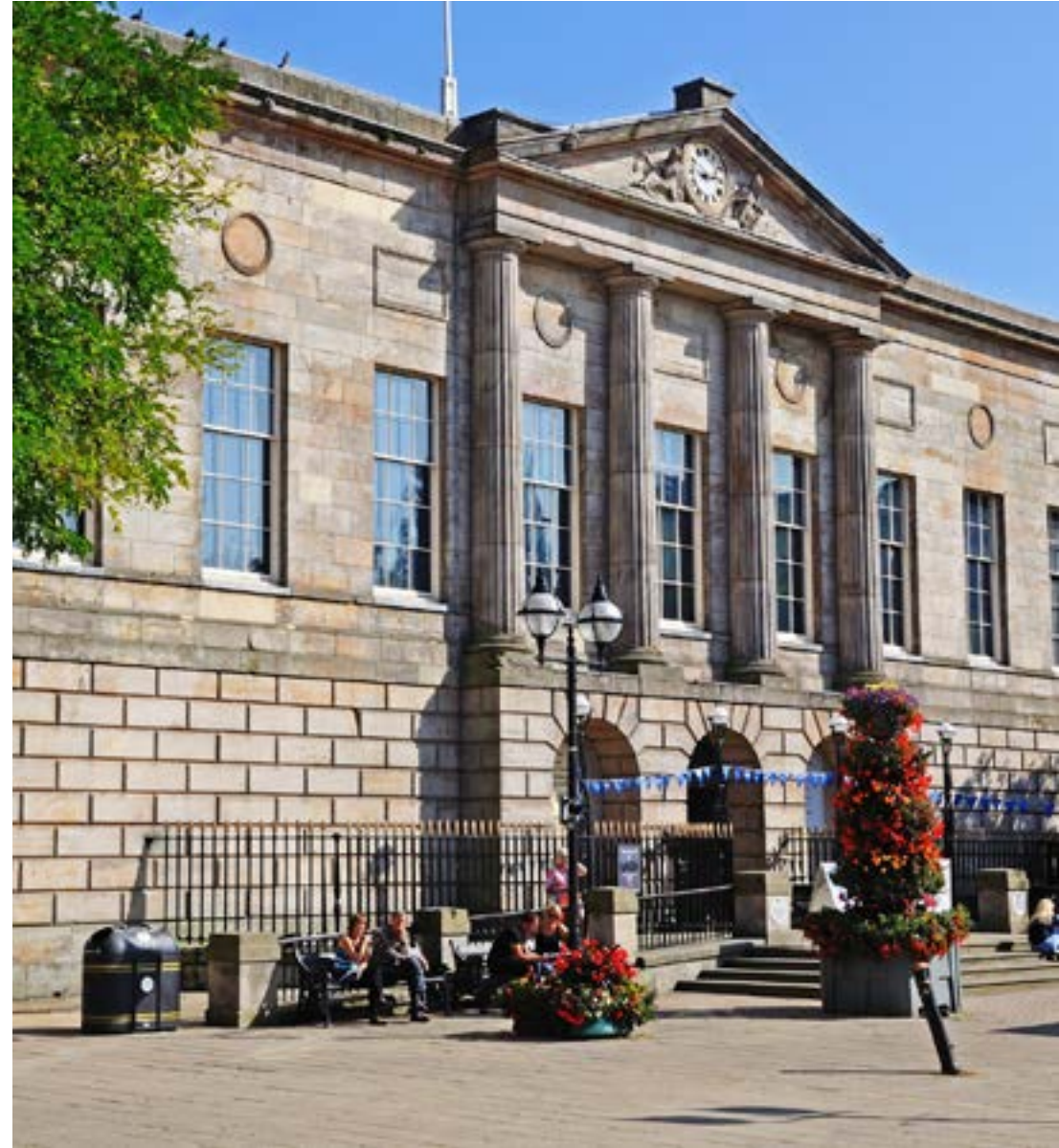
A new £2m refurbishment has unveiled the popular Shire Hall Enterprise Centre – supporting start-up and growing business with flexible support and terms

Achieving this will require a focus on several issues. We will need to ensure that the county has the right infrastructure in place, including high-quality premises, broadband and transport connectivity. Business and innovation support also remains key, including increasing innovation activity within the county, the provision of good-quality advice, and access to finance when appropriate. There is also an important role for the education and skills system in ensuring people recognise that starting their own business is a viable career option and equipping them with the skills needed to start and grow a business.