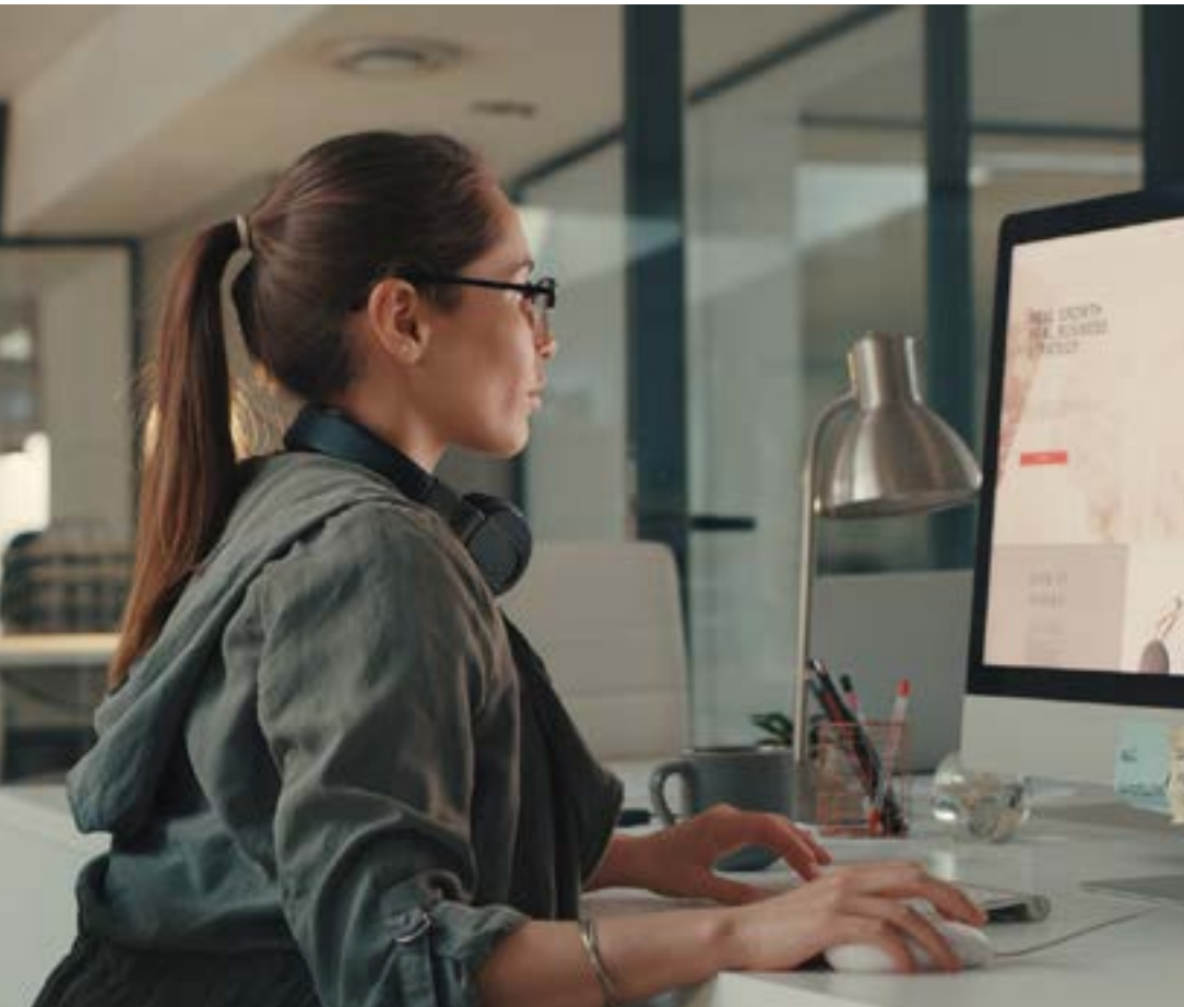
There are opportunities to address long-term skills issues such as digital and leadership and management

Existing programmes and potential flexibilities provide the opportunity to address skills issues to some degree, but there is an opportunity to be more transformative and start to deliver programmes that address longer-term skills issues such as digital, leadership and management, business improvement, lean, agile and automation programmes. Many of these types of skills are vital for business growth and enable people to successfully start and grow a business.