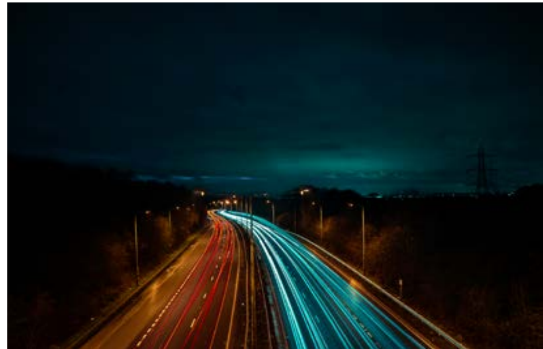
We'll unlock investment in road, rail and digital connectivity across our strategically-important growth 'corridors'