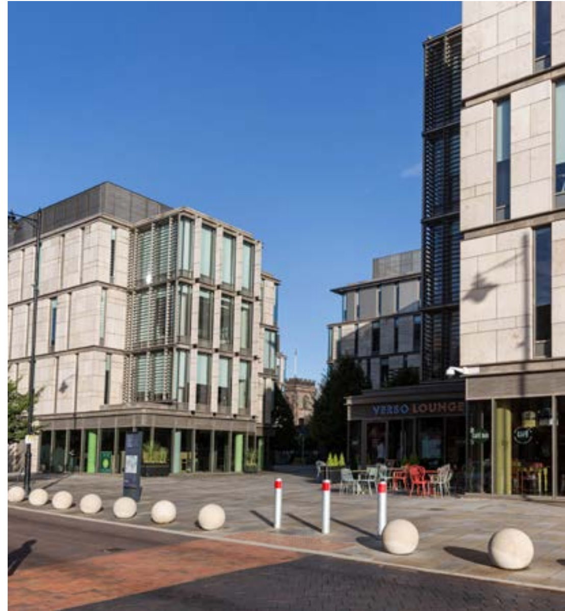
Supporting thriving Town Centres is a central priority for our Economic Strategy

Our Strategic Infrastructure Plan shows that there is evidence of underinvestment in some of Staffordshire's infrastructure, whilst appropriate investments will help in the delivery of the substantial growth planned within the county in the coming years and enable us to achieve both local and national ambitions to support increases in jobs and homes.