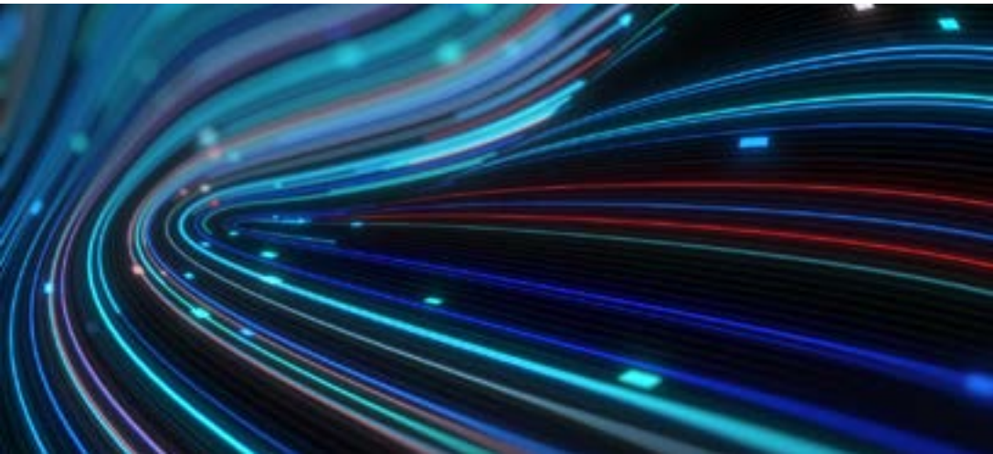
Digital connectivity is more important than ever

The county town of Stafford and larger towns throughout the county including Burton upon Trent, Uttoxeter, Cannock, Rugeley, Lichfield, Tamworth, Newcastle-under-Lyme, Biddulph, Leek and Cheadle remain the primary hubs of economic activity and where most of our residents live and work. The changing nature of retail has presented challenges for almost all town centres, at least somewhat compounded by the pandemic, with work to reshape and repurpose town centres being an increasingly important issue.