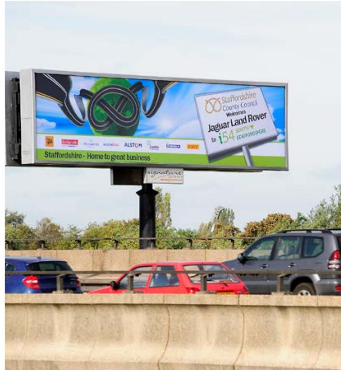
i54 South Staffordshire, one of our investment ready sites, is home to global brand Jaguar Land Rover