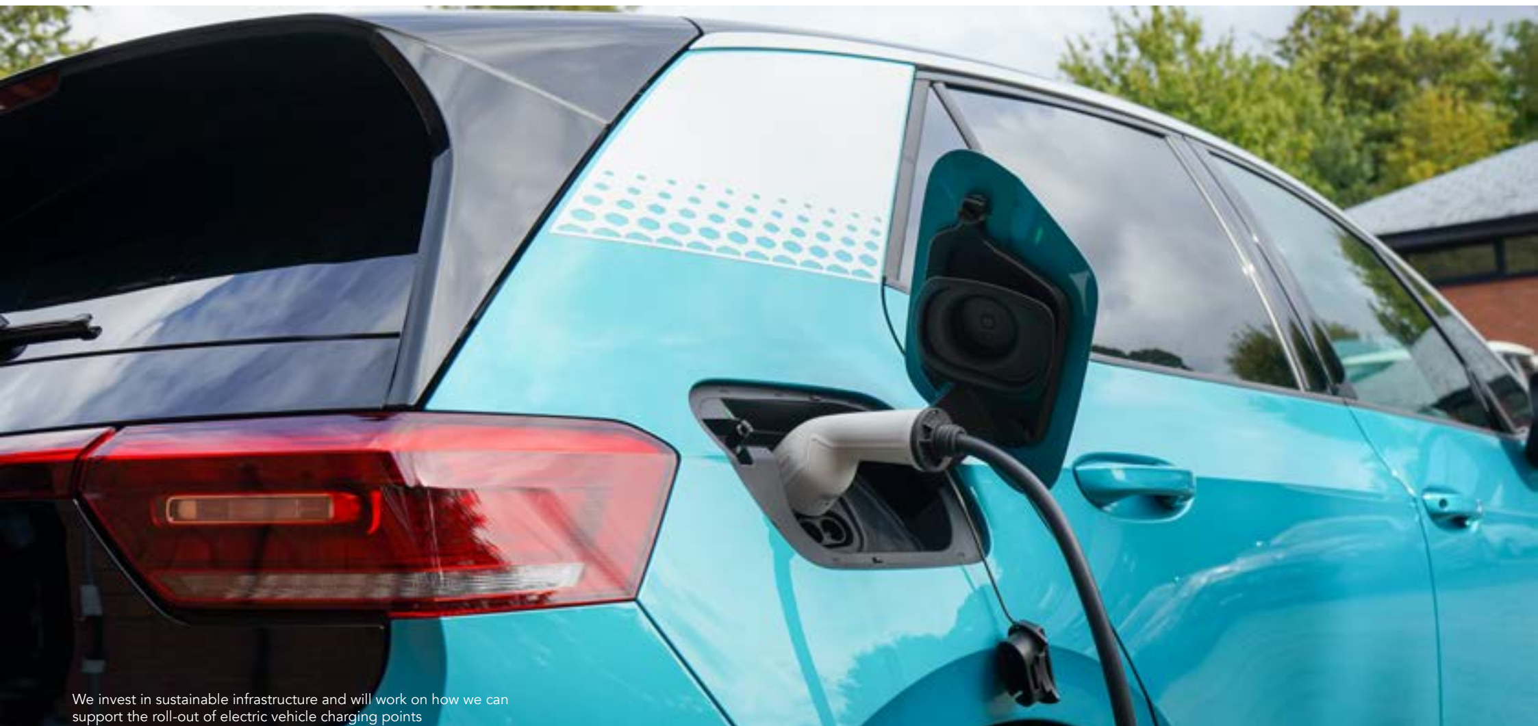
We invest in sustainable infrastructure and will work on how we can support the roll-out of electric vehicle charging points