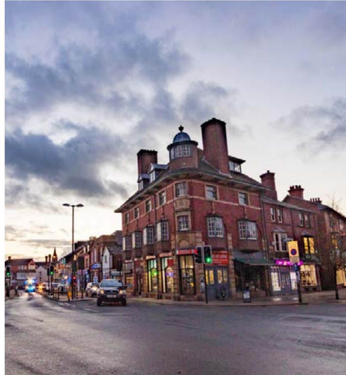
The creation of Town Plans, including that for Leek Town Centre, are part of our strategy