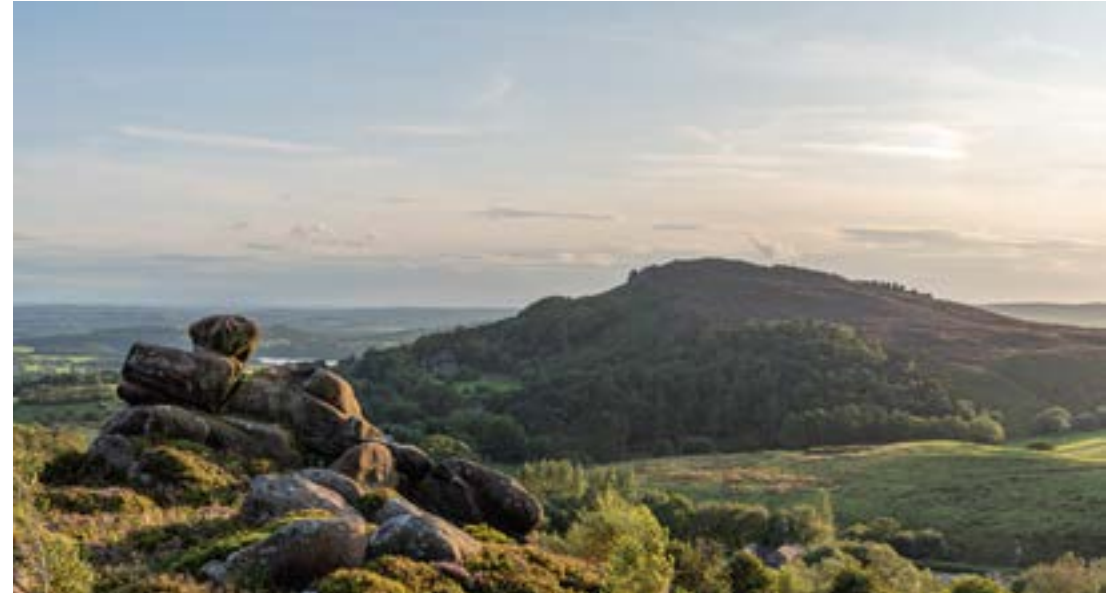
There's been significant development in our rural economy in recent years.