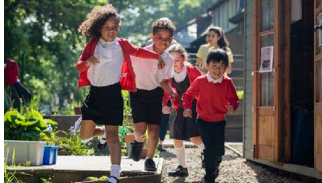
Embedding the skills for the jobs of the future begins early on

However, there remain challenges with skills within the county that we need to address. Some areas continue to lag in the skills levels of residents, particularly within Cannock Chase, Tamworth, and parts of Newcastle-under-Lyme. These areas have had relatively low levels of skills amongst residents for many years and addressing this situation will have significant advantages in enabling our residents to take advantage of better paid job opportunities. We will need to ensure our residents are aspirational for their future, whilst also supporting people working in lower paid jobs to transition into higher paid employment and supporting affected businesses to be more productive and innovative through new technologies and digitisation. We recognise that not all our residents will want a highly skilled job, but everyone should at least have the opportunity to get a good job that provides a high level of satisfaction and / or value to society, even if it remains lower paid.