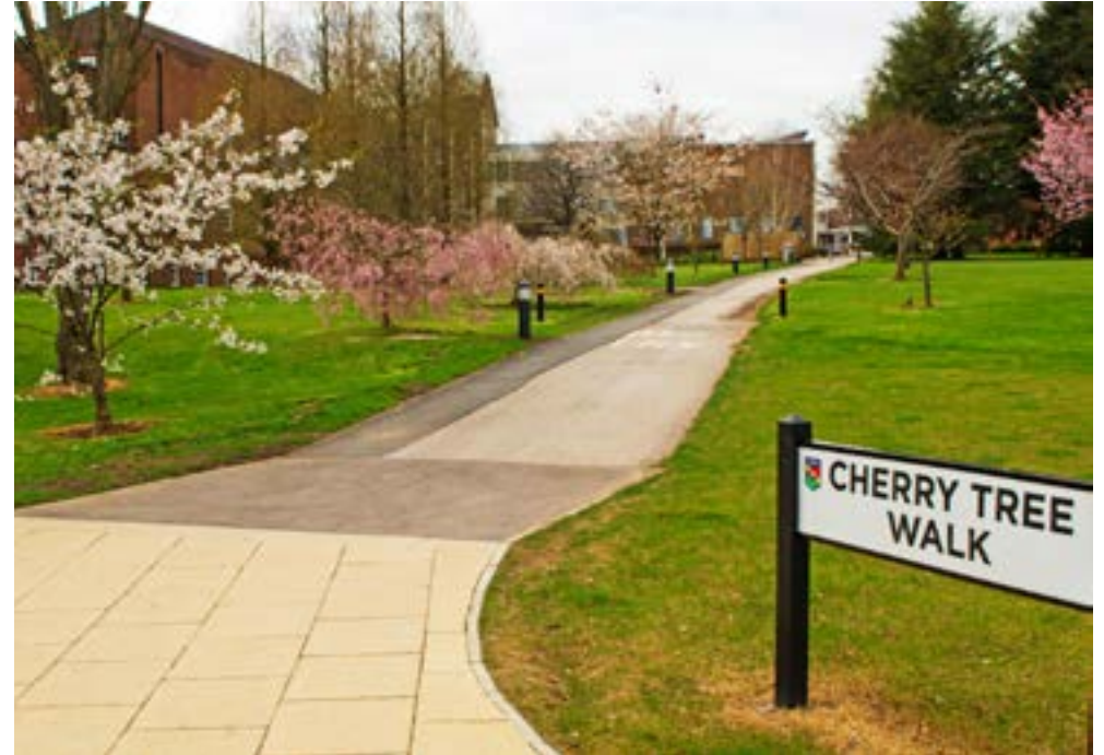
Energy innovation in Staffordshire includes the work of Keele University with their Smart Energy Network Demonstrator (SEND)

From a relatively low base, innovation within Staffordshire is also on the rise, both within businesses and through our universities. Ongoing and recent innovation projects delivered by Keele University include the Smart Energy Network Demonstrator, the HyDeploy project to trial injecting hydrogen into the gas network, and the Association of Directors of Environment, Economy, Planning and Transport's (ADEPT) - supported SMART transport 'live-lab' project. The Newcastle and Stafford Colleges Group meanwhile continues to lead on the planned Institute of Technology in Stafford that will focus on those high-level manufacturing and engineering skills needed by many local businesses.