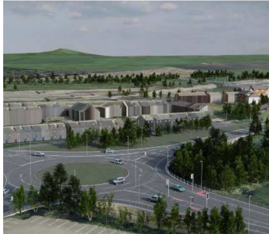
The Stafford Western Access Route has opened up investment potential and relieved traffic congestion in the area

For projects and programmes which the County Council is responsible, we will continue to plan proactively to deliver those schemes to support development and fully realise its benefits. The County Council continues to have significant assets within the county, and we will develop projects to ensure that we are maximising the value of these assets to deliver our ambitions for the future of Staffordshire and its economy.