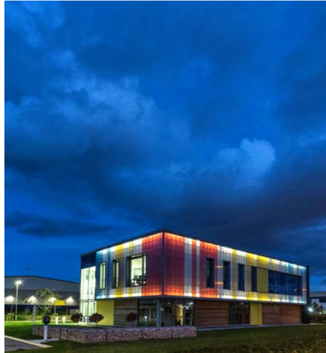
Unlocking land at Redhill Business Park in Stafford has led to ongoing investment from the private sector