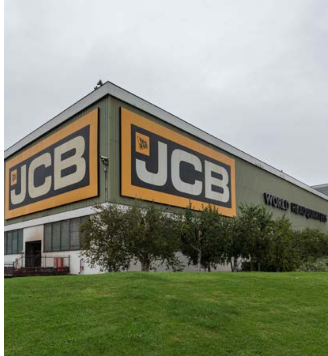
We'll work with the private sector, including JCB on the A50/A500 'economic corridor' to bring growth