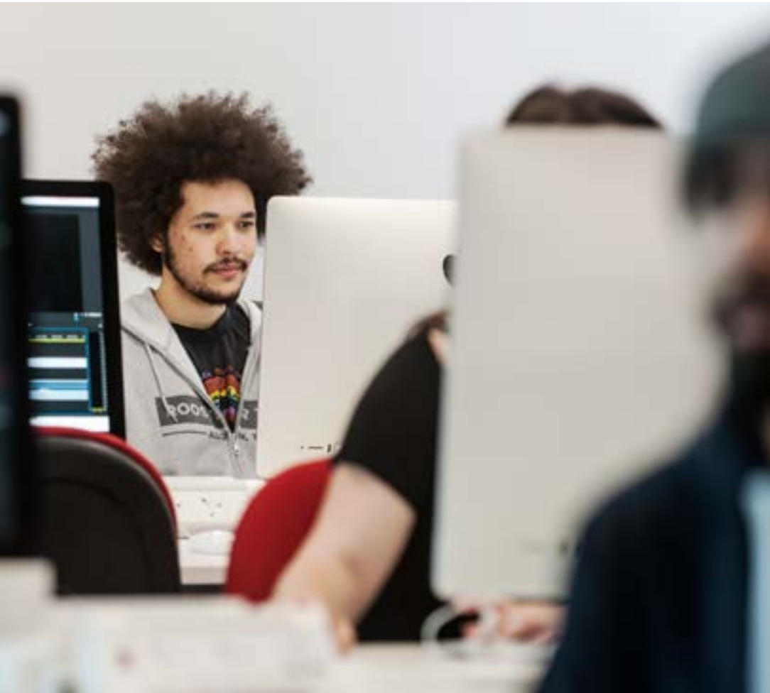
The County Council has a long history of working with our local universities

The County Council has a strong history of working with all our universities, colleges, and other skills providers across a wide range of issues and this will continue to be essential, as detailed throughout the Strategy.