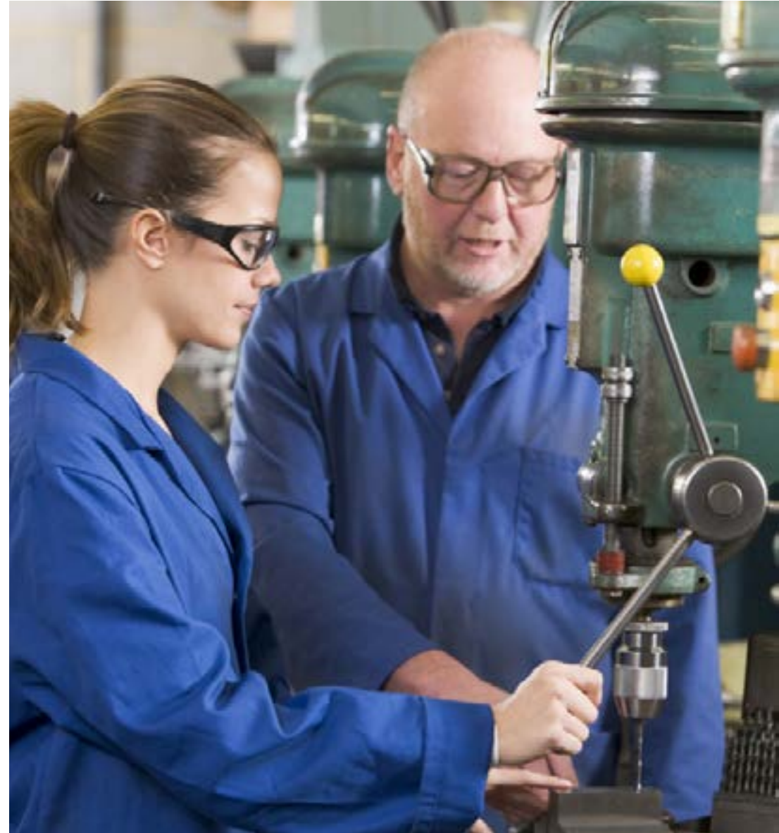
Supporting people with the skills for the jobs future, including manufacturing and working in the green industries, is key

Further strategies of relevance include the Net Zero, Heat & Buildings, Hydrogen, and Industrial Decarbonisation strategies, as well as the Energy White Paper and Transport Decarbonisation Plan. All these documents and the policies within them will have at least some relevance to Staffordshire and will be considered as part of the projects and programmes to deliver of our Economic Strategy.