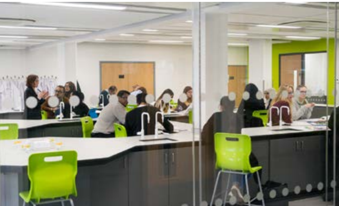
We have several high-performing colleges in Staffordshire

No longer just the place for traditional skills, the county's residents are increasingly gaining higher levels of skills and qualifications, whilst there is a workforce of over three million people all within an hour of Staffordshire. As a county we continue to respond to business need for more advanced skills including manufacturing, engineering and digital skills, and our universities will allow us to further develop those skills needed across many of our current and future industries. We have high performing colleges across all parts of the county, whilst many academy trusts are providing an innovative approach to our school age education in supporting the skills of our next generation of employees.