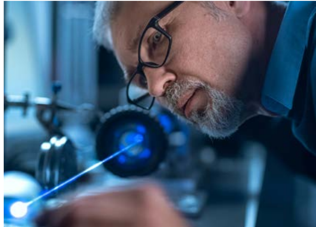
Innovation has increased substantially in Staffordshire in recent years.