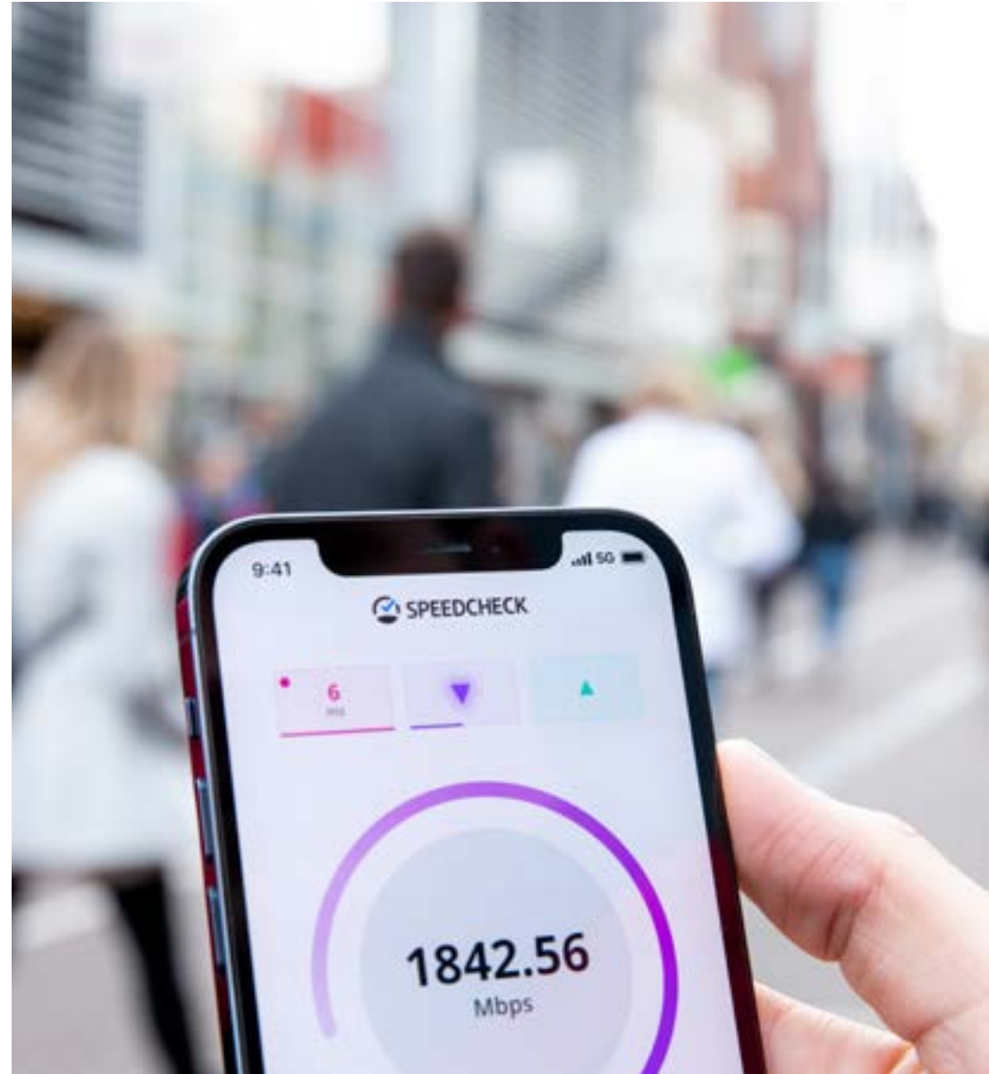
We'll speed up our plans for high-quality digital infrastructure, including 5G.