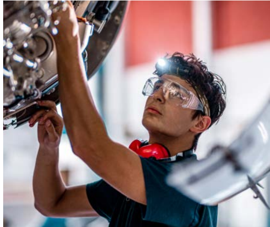
We're supporting residents to gain higher-level skills for good jobs in the growth sectors, such as manufacturing

We recognise that Staffordshire County Council will not be able to achieve these ambitions by working in isolation, and we will need to continue working with all our partners if we are to be successful. We have a strong track record of such partnership working, including the delivery of numerous hugely successful economic growth and infrastructure schemes with our District and Borough Councils and by securing substantial levels of investment into the county.